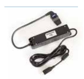
USB communications lead